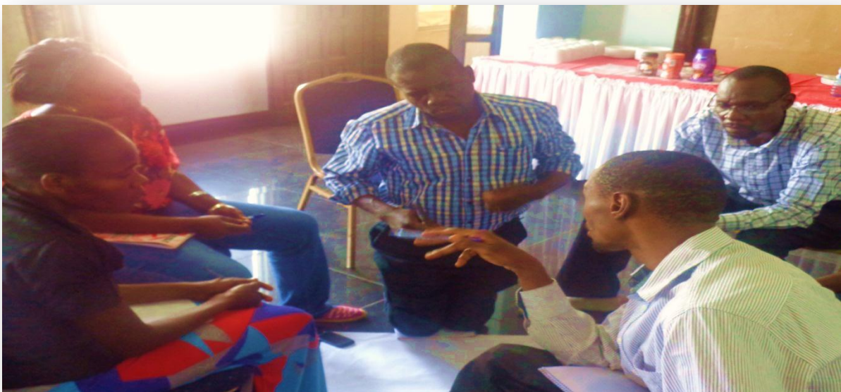
NRHS mobilizers and Research Assistants in a CBFP induction training group work

The SHAPE-LVB model is based on the mutual, cause, effect and complementary linkages within the PHE and Community Based Family Planning (CBFP) approaches, that is Population affects Health which in turn affects Environment. Planned population growth through family planning leads to healthy living and sustainable environmental conservation